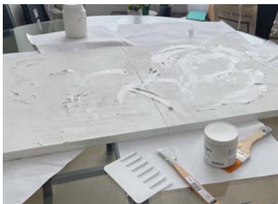
Below: Getting started Bottom: Detail of one of the first layers

As I continued with the process through these layers sometimes it