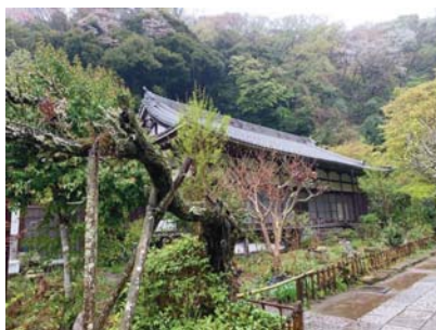
Top: Germany Above: Japan

The more we grow an inner connection to the life force through our core truth, the more its energy amplifies its benefits in our lives.