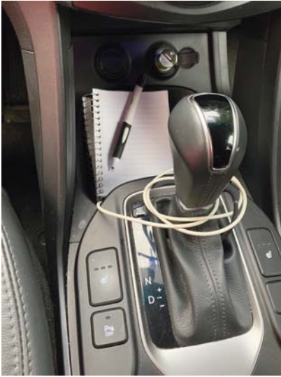
Left: Always at the Ready Right: Always at the Ready 2