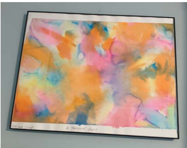
A Thousand Angels

Some days, weeks or seasons, life is tough and I do not have the emotional bandwidth to create. Fallow times are important too. I am comfortable resting and restoring 'Me'. I'm also comfortable incubating ideas. They are born when the time is right. Patience is part of the creative path too. Patience is the twin sister of persistence. I strive to ensure my productivity is not sidelined by perfectionism. Writers know a first draft sparkles with potential and needs multiple revisions. Stopping to revise is not being stuck. Editing is a phase of writing.