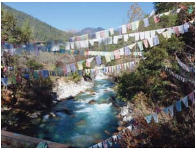
Top: Ethiopia Above: Bhutan