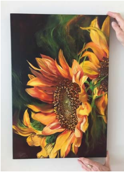
Left: Sun Dancers Middle: Returning . Photograph Right: My brother