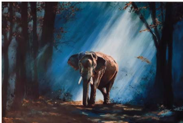
Following the Light

of colour and energy in my painting. My dreams of a home with a garden, art studio, family and sanctuary from a frantic urban pace came into focus. Many of the treasured memories that formed me came flooding back and were reflected in my painting. A vibrant painting of sunflowers danced onto my canvas and filled me with joy. I call it Sun Dancers and felt their energy beckoning me.