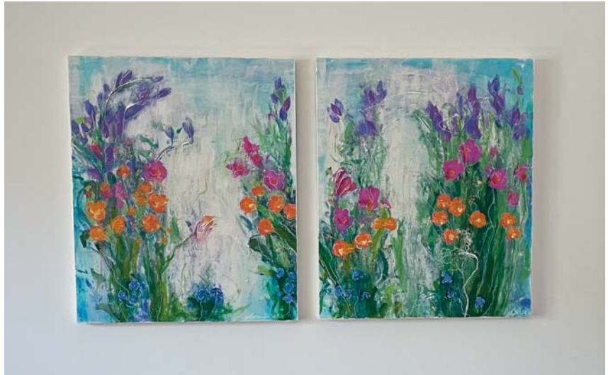
Right: The completed artwork, Growth Emerging

became difficult again: Where was this going? Journalizing was integral to the process with the reflections on what I was doing. As I continued to add layers to the painting, what emerged in my notes was the desire for authenticity and being true to myself. I didn't know when I began painting that I would go to florals. Then in reflection I realised they express the anticipation of spring and early summer. After the grey winter season it was refreshing to see the new growth and colour, and be rejuvenated. The resilience I sometimes take for granted as I pass by nature in the changing seasons I see now as nothing short of miraculous, and I think of the resilience that I've experienced and seen in others, particularly after the fires here in Kelowna last summer. I found myself enjoying simple things, like watching the birds in the backyard in and around the birdbath, the bird house and among the trees and flowers, and spending time with my toddler grandson in the backyard, seeing his joy watching the birds. I realised that it is presence in these moments with him and others that mean everything.