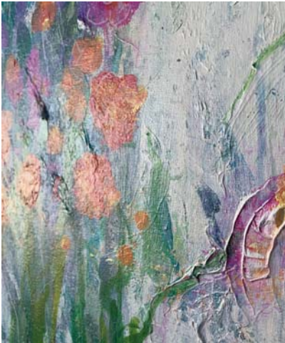
Top: The green layer