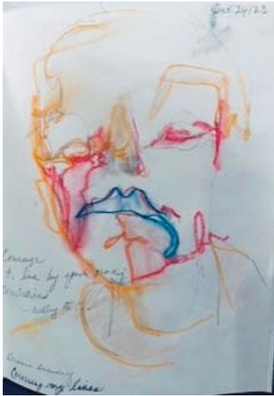
Courage, Caressing my Lines (blind contour drawing)

I am currently grateful for the new skills and perspective I have gained as the result of my shift in focus: to the art-making process versus the creation of an art product.