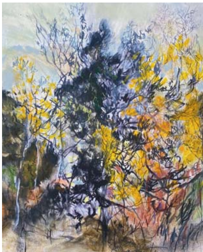
Top left: Climate for Change , from Terre Mémoire , 2004, found canvas with acrylic and gold leaf, 60 x 36 inches