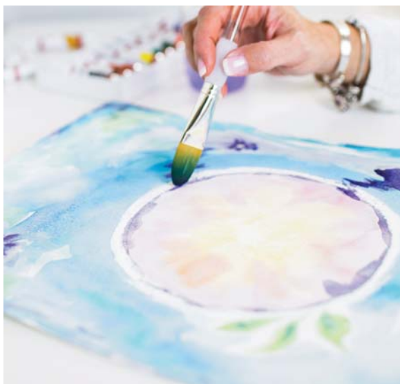
Painting a watercolour mandala

In this world we are living in with polarized religious and political views, this offering of an alternative, of what Rohr