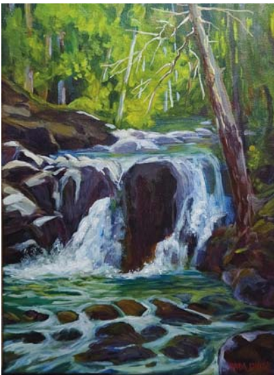
Top left. Grape Jelly . Acrylic, 2023 Top right. Tree Climber's View , 2023. First Place award, Federation of Canadian Artists Above. Springer Creek . Acrylic, 2023