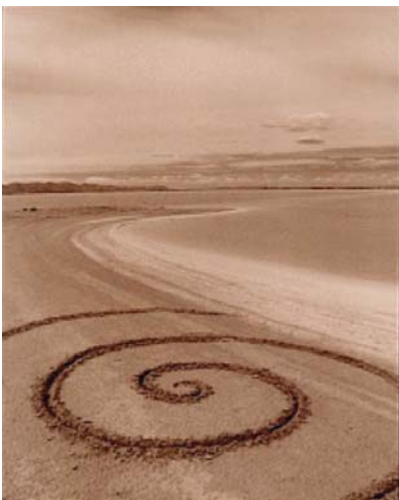
Cosmic Harmony

In his last book, written in 2014, Csíkszentmihályi points out, “Evolutionary cells will make it possible to experience flow while working for the most ambitious goal available to the human imagination: to blend our individual voice to join in our unique consciousness with the emerging consciousness of the universe, to fold our momentary centre of psychic energy into the current that tends toward increasing complexity and order” ( The Evolving Self: A Psychology for the Third Millennium ). Such is my hope for the evolution of The Journal .